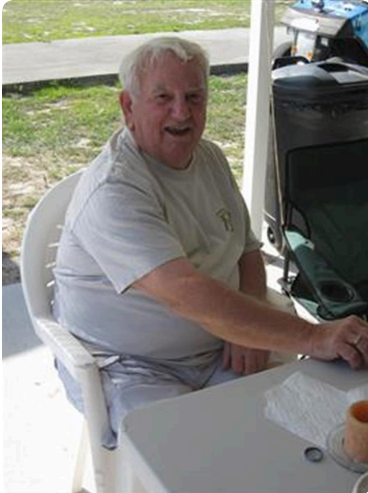
Fun at 7 Oaks RV Park